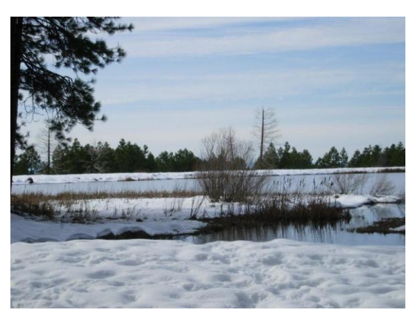
Clean & algae free! Easy Accessed most days of the year and wheelchair accessible even in poor weather! Also well used and loved for over 106 years. (See Appendix A).