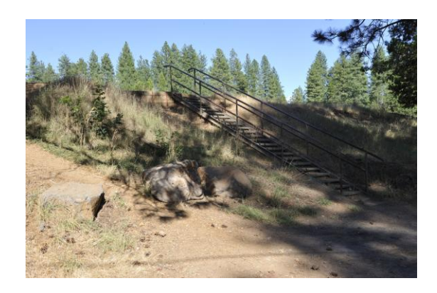
STAIRS FROM PARKING AREA